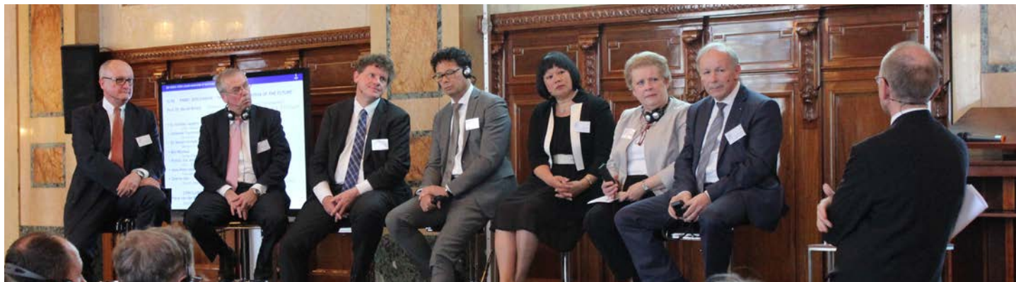
The public debate organised at the occasion of the celebrations marking the CCNR's bicentenary at Rotterdam's City Hall.