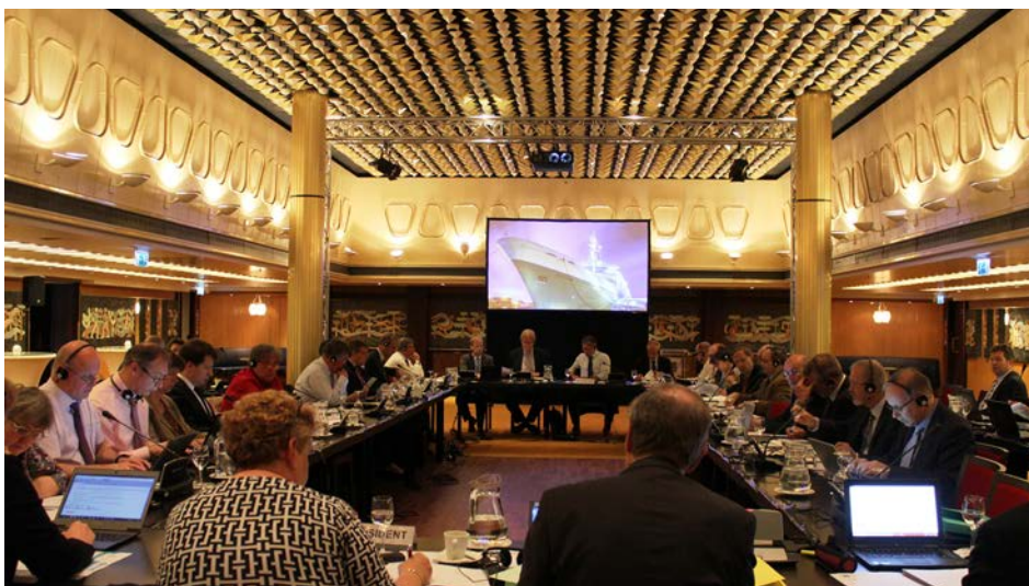
The plenary session was held exceptionally on board of the former cruise ship ss Rotterdam.

In the first half of 2014, the trend in the evolution of turnover for the transport of goods was still slightly upward, but the situation deteriorated in the second